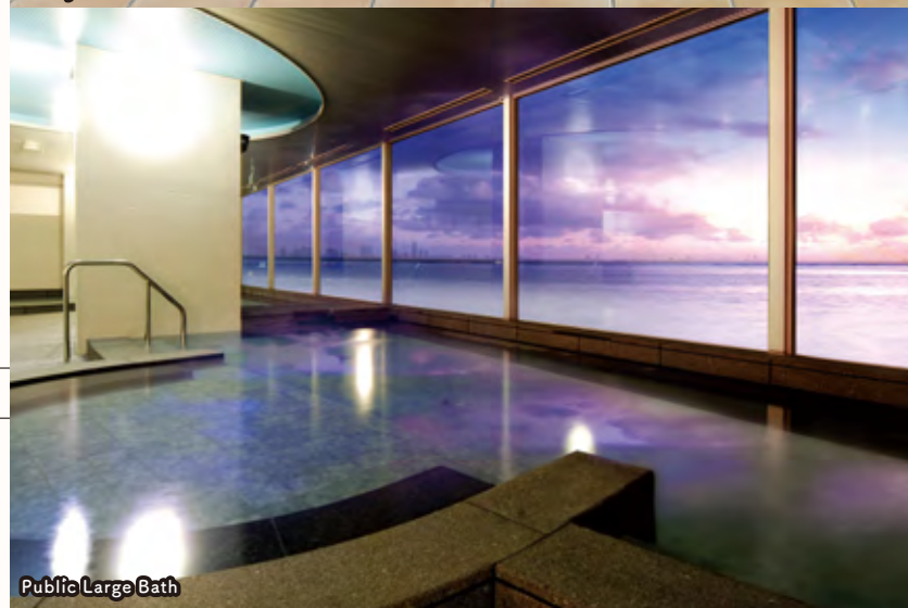
Public Large Bath