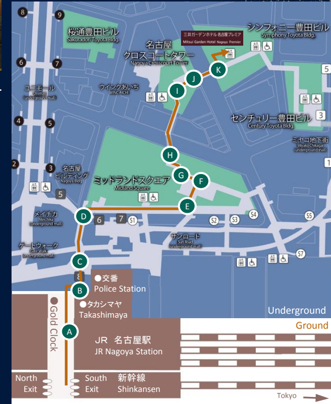
Go out of Midland Square and walk toward Symphony Toyota Bldg.