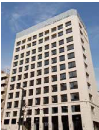
Mitsui Garden Hotel Yotsuya

Mitsui Garden Hotel Yotsuya offers a comfortable space and a variety of conveniences. Located near JR Yotsuya Station, the hotel is ideal for a range of private and business occasions.