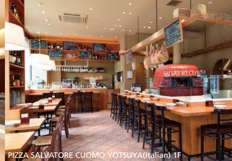
PIZZA SALVATORE CUOMO YOTSUYA(Italian) 1F