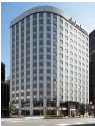
Mitsui Garden Hotel Ueno

Easily accessible from busy Ueno station, our hotel provides quiet, comfortable accommodation in well-designed rooms.