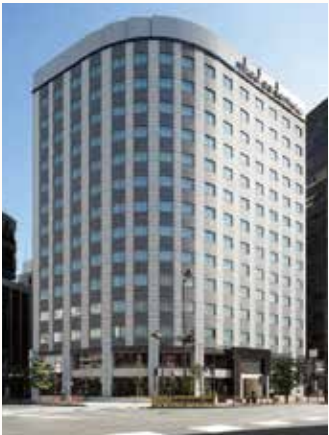
Mitsui Garden Hotel Ueno

Easily accessible from busy Ueno station, our hotel provides quiet, comfortable accommodation in well-designed rooms.