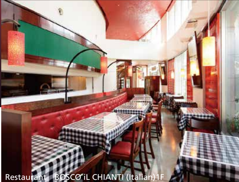
Restaurant BOSCO'IL CHIANTI (Italian)1F

3-19-7, Higashi-ueno, Taito-ku, Tokyo, 110-0015 TEL:03-3839-1131 FAX: 03-3839-1605