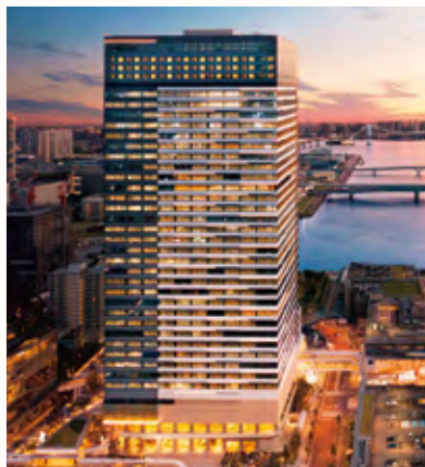
Mitsui Garden Hotel Toyosu PREMIER

Our hotel offers excellent access to Tokyo by being directly connected to Toyosu Station.