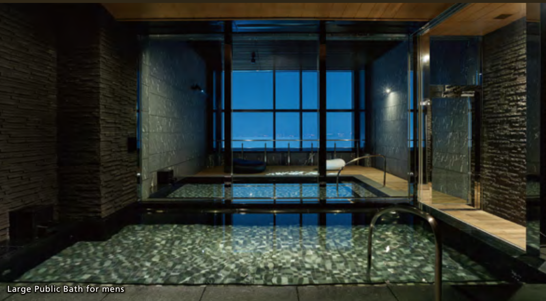
Large Public Bath for mens

Located on the 36th floor, enjoy the scenery at this restaurant where seasonal vegetables and seafood ingredients are delivered directly from Toyosu to bring you dynamic appetisers and main courses. Sample freshly made pasta, oven-fired pizza, and more. We have semi-private rooms that offer fantastic views and as well as an open terrace to enjoy the cool breeze while dining. Whether you're here on business or with family, you'll find it enjoyable regardless of the occasion.