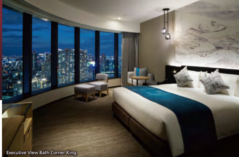
Executive View Bath Corner King