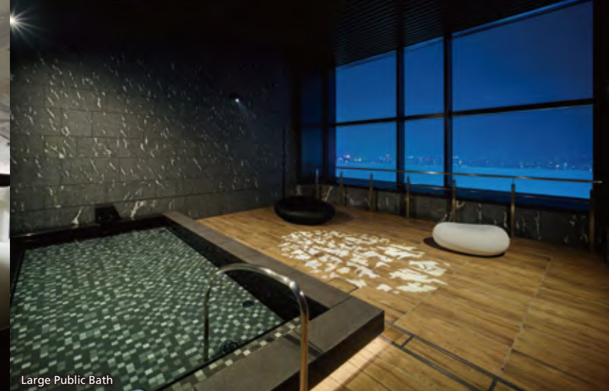
Large Public Bath