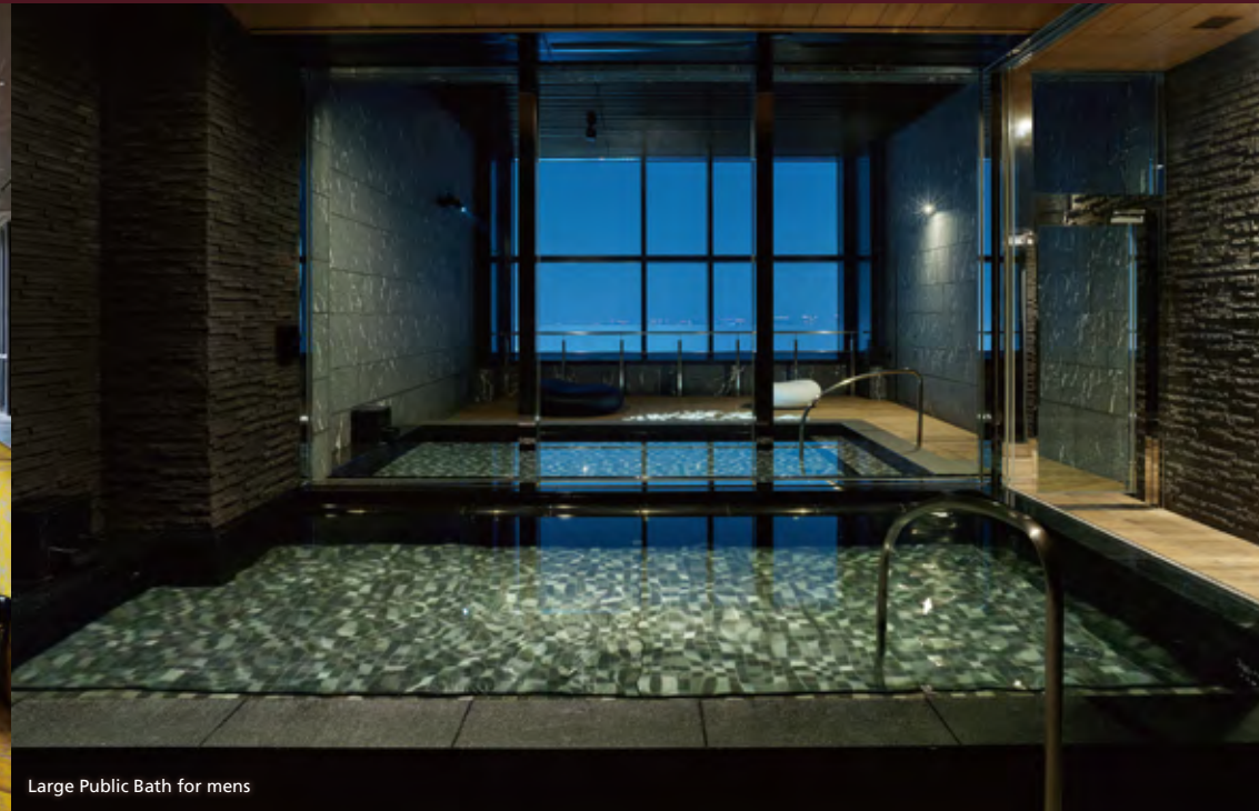
Large Public Bath for mens