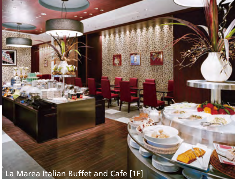
La Marea Italian Buffet and Cafe [1F]

2-14-24, Higashi-shimbashi, Minato-ku, Tokyo, 105-0021 TEL:03-3431-1131 FAX:03-3431-2431