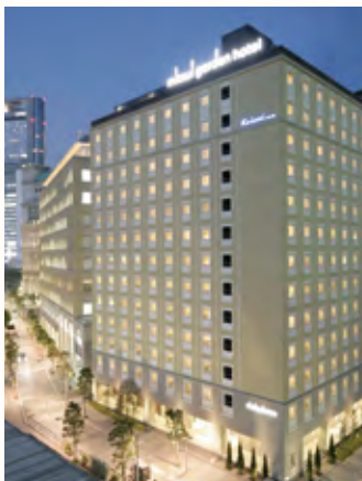
Mitsui Garden Hotel Shiodome Italia-gai

A sophisticated hideaway hotel, offers an Italian ambiance while having a sense of fun escape from the hustle and bustle of the city.