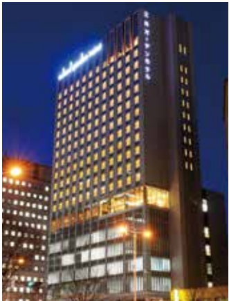
Mitsui Garden Hotel Sendai

We invite you to take private time for yourself and relax as an adult in the sense of 'exclusivity' and 'comfort' offered by our chic atmosphere.