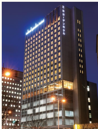
Mitsui Garden Hotel Sendai

We invite you to take private time for yourself and relax as an adult in the sense of 'exclusivity' and 'comfort' offered by our chic atmosphere.