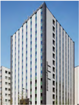
Mitsui Garden Hotel Sapporo

Here, Japanese hospitality and a quiet, comfortable room provide you to enjoy a completely relaxing time.