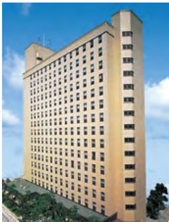
Mitsui Garden Hotel Osaka Yodoyabashi

The comfort of our guests is the treasure we hold.