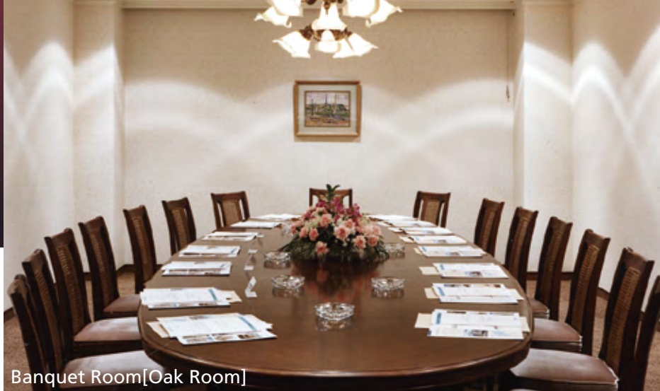
Banquet Room [Oak Room]

2-5-7 Koraibashi, chuo-ku, Osaka, 541-0043 TEL:06-6223-1131 FAX:06-6223-0257