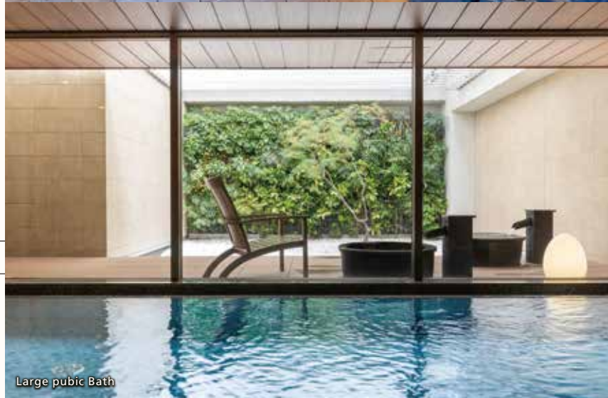
Large public Bath