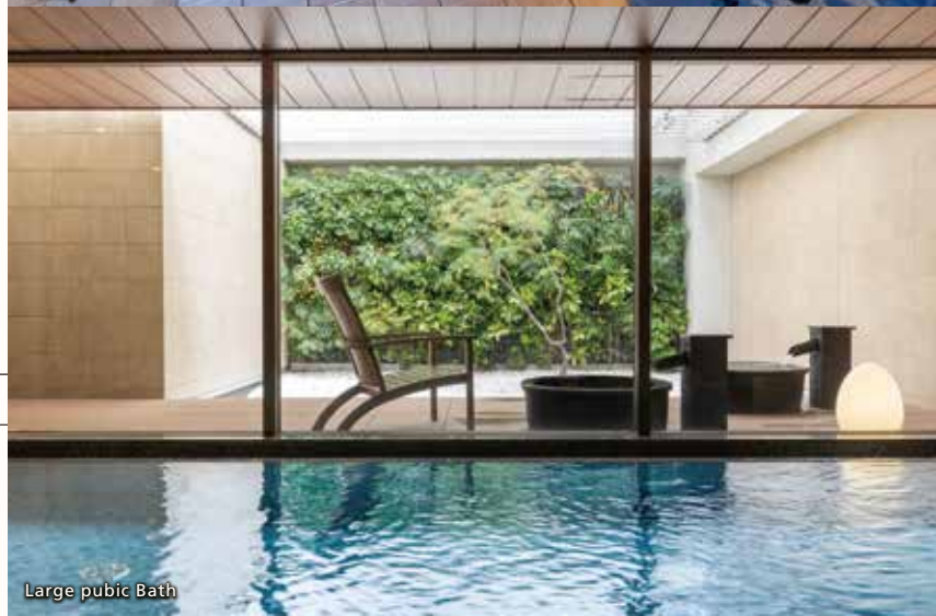
Large public Bath