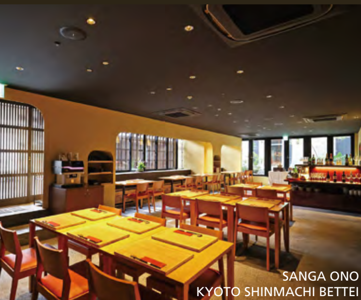
SANGA ONO KYOTO SHINMACHI BETTEI