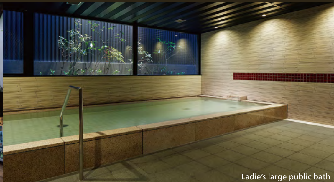
Ladie's large public bath