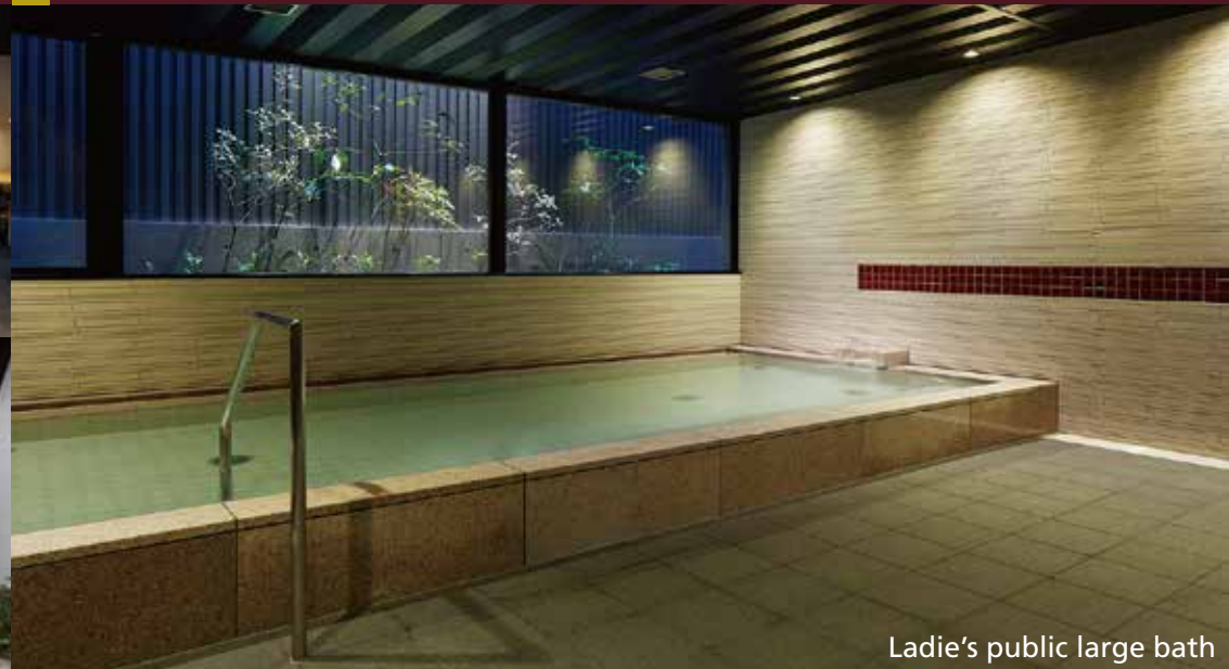
Ladies' public large bath