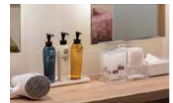
Powder Room (Ladies' bath)