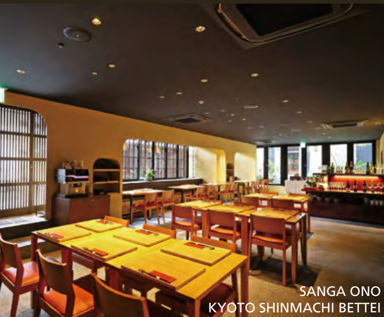
SANGA ONO KYOTO SHINMACHI BETTEI