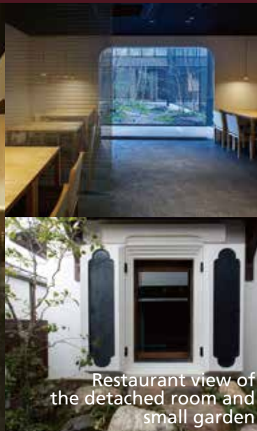
Restaurant view of the detached room and small garden