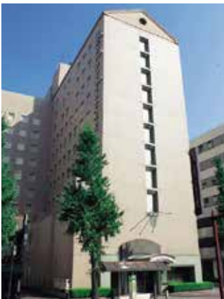
Mitsui Garden Hotel Kumamoto

Gently close your eyes and find peace of mind. It will evoke moments and conversations in similar surroundings.