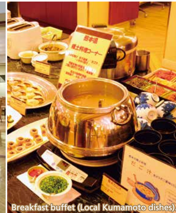
Breakfast buffet (Local Kumamoto dishes).