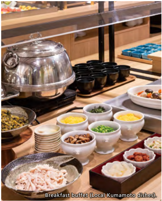
Breakfast buffet (Local Kumamoto dishes).