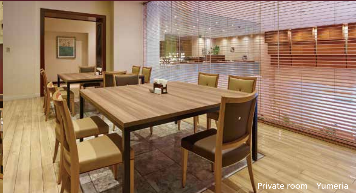
Private room Yumeria