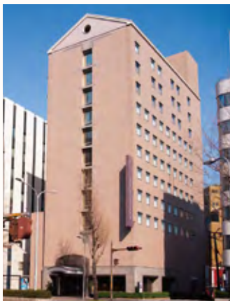
Mitsui Garden Hotel Kumamoto

Gently close your eyes and find peace of mind. It will evoke moments and conversations in similar surroundings.