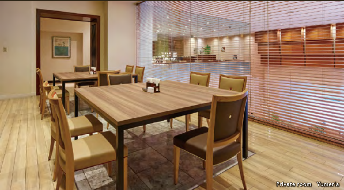
Private room Yumeria

The “Garden Café” is a stylish casual café and restaurant. For the start of your day, we prepare a buffet breakfast wide variety of Japanese and Western style dishes. The buffet includes local Kumamoto dishes made from locally sourced ingredients for guests to enjoy.