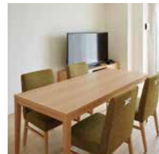
3 beds, Service Apartment (living)

*The area of this room is calculated using the center line of the wall, including the pipe shaft. The number is rounded off to one decimal place.