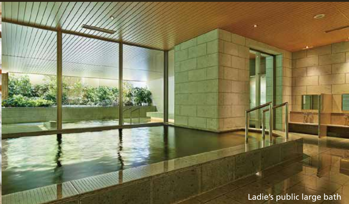
Ladie's public large bath

Italian restaurant proudly offering menus made with local ingredients, such as vegetables grown in nearby farms. The buffet style breakfast serves Western cuisines. The restaurant may be privately reserved during lunch and dinner time, so please check in advance.