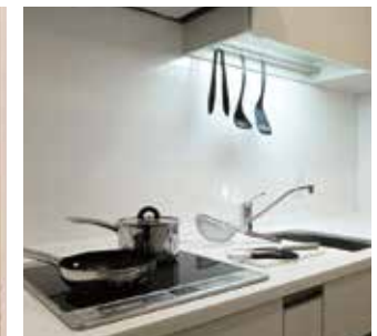
Deluxe, 1 bed Queen (kitchen)