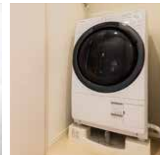
Deluxe, 1 bed Queen (washing machine and clothes dryer)