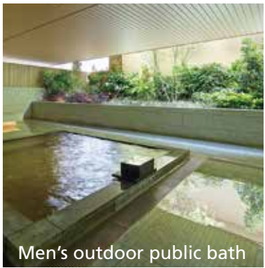
Men's outdoor public bath

A treadmill, a stationary bike, an elliptical (cross-) trainer and an exercise mat are provided for your use and the benefit of your health.