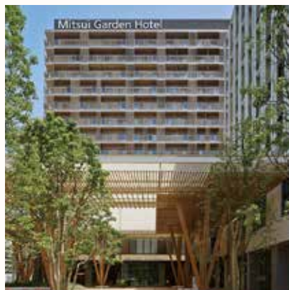
Mitsui Garden Hotel Kashiwa-no-ha

Please relax and enjoy the surroundings of "Kashiwa-no-ha Gate Square".