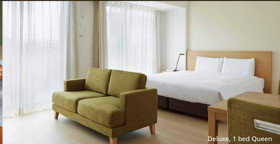
Deluxe, 1 bed Queen

The green and wood décor make for a relaxed ambiance in our stylish twin rooms. Whilst naturally perfect for couples, some of them also feature a sofa bed, allowing them to accommodate up to 3 guests.