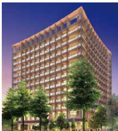
Mitsui Garden Hotel Jingugaien Tokyo PREMIER

"Jingu Gaien no Mori" is a vacation home that provides a front seat to the greenery, views and excitement of the city.