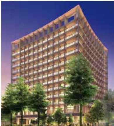
Mitsui Garden Hotel Jingugaien Tokyo PREMIER

"Jingu Gaien no Mori" is a vacation home that provides a front seat to the greenery, views and excitement of the city.