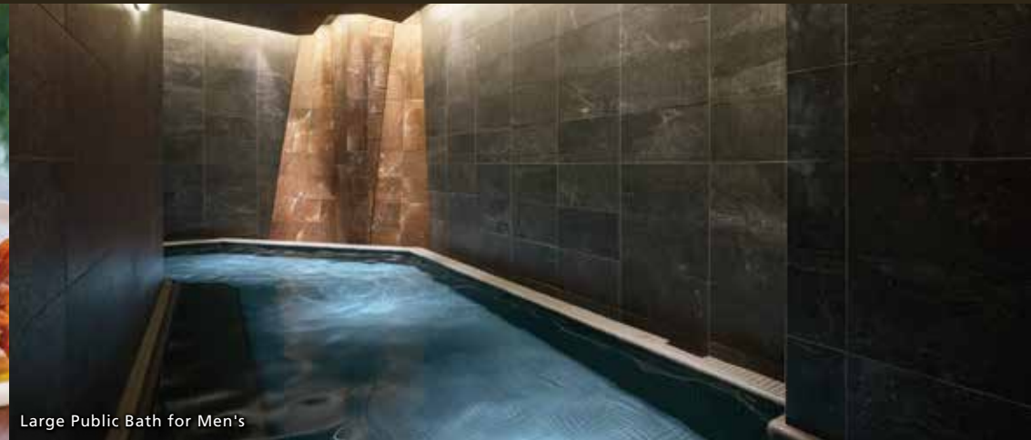
Large Public Bath for Men's