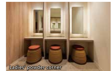
Ladies' powder corner