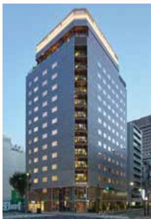
Mitsui Garden Hotel Ginza Tsukiji

A hotel situated between Tsukiji, an area steeped in history and culture, and Ginza, an area where all the luxury brands are located. We offer a stay for guests that includes the luxury of Ginza but the everyday life and culture at Tsukiji.