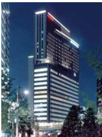
Mitsui Garden Hotel Ginza Premier

The stylish design of our earth-tone interior creates a relaxing atmosphere for your stay.