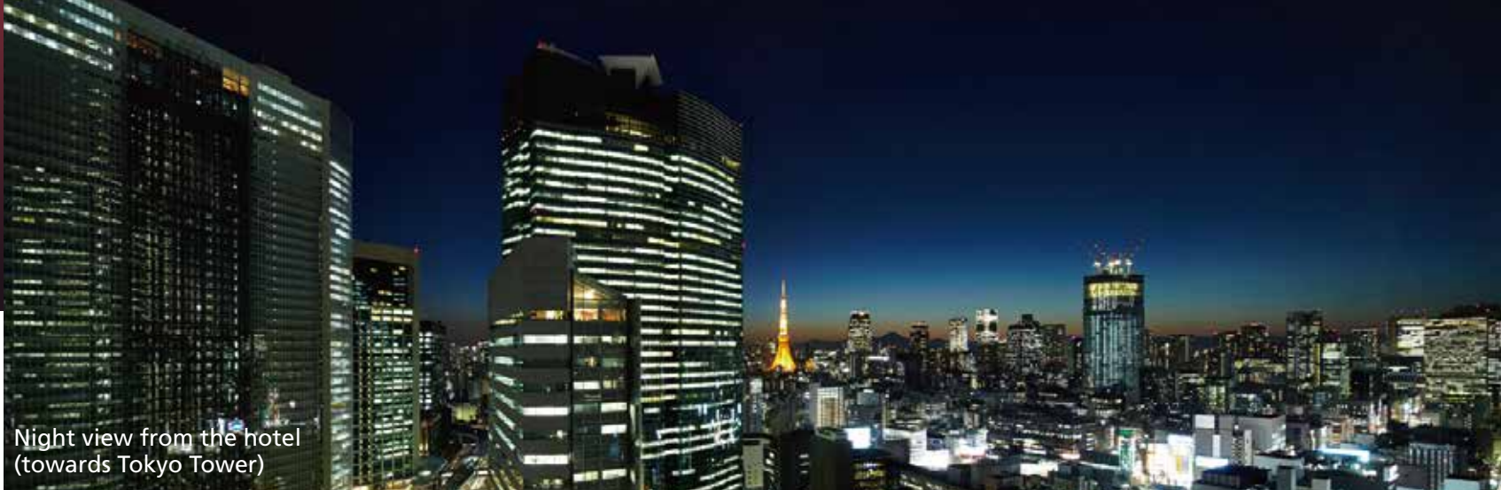
Night view from the hotel (towards Tokyo Tower)

8-13-1 Ginza, Chuo-ku, Tokyo 104-0061 TEL:03-3543-1131 FAX:03-3543-5531