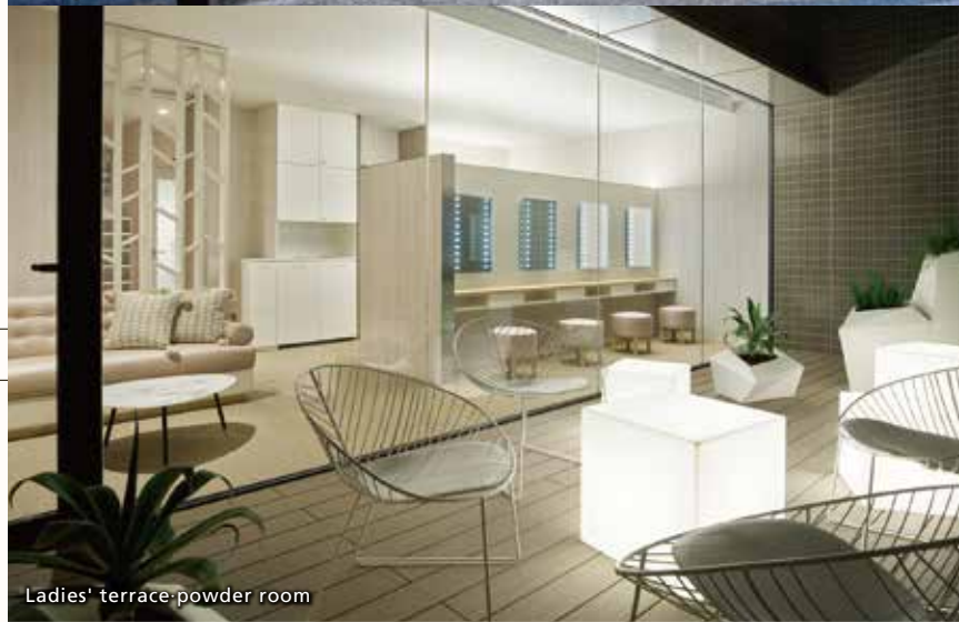
Ladies' terrace powder room