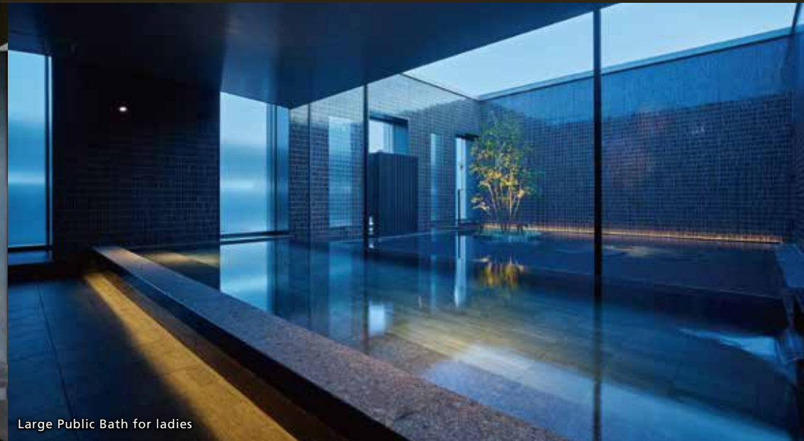
Large Public Bath for ladies