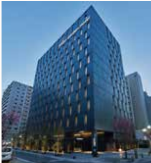
Mitsui Garden Hotel Fukuoka Nakasu

Stretch your arms, legs and spend a rejuvenating moment to soothe away the day worth of fatigue.