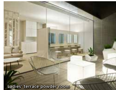
Ladies' terrace powder room

*Please note the menu and the service time may change without notice.