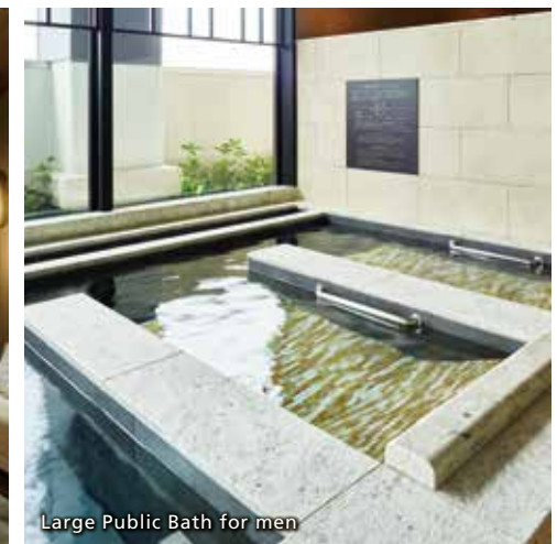
Large Public Bath for men