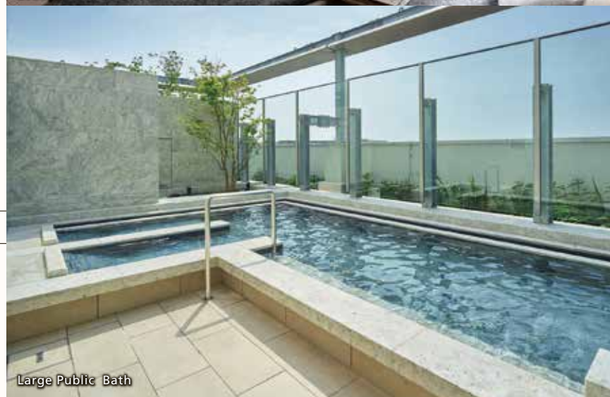
Large Public Bath