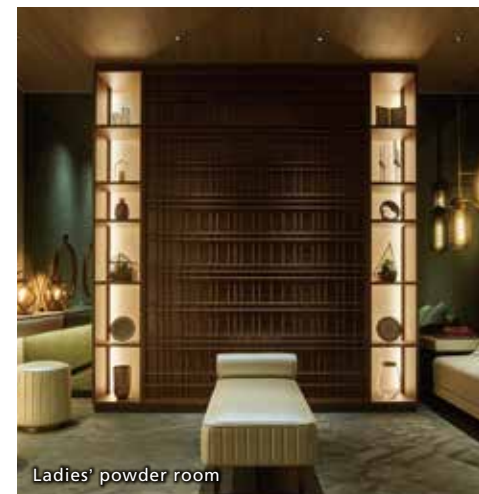
Ladies' powder room