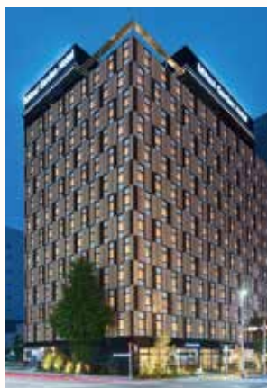
Mitsui Garden Hotel Fukuoka Gion

Discover Hakata once again along with indoor and outdoor bath located on the top floor of the hotel.