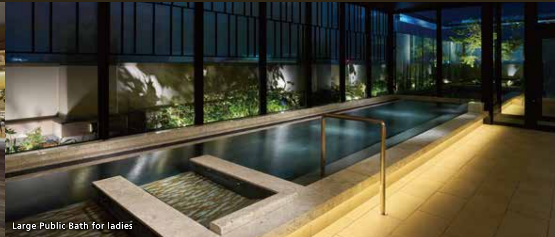
Large Public Bath for ladies