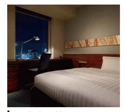
Standard Double [16.5m<sup>2</sup>]

Queen size bed and a relaxing sofa even for 2 people relaxing at Solo.