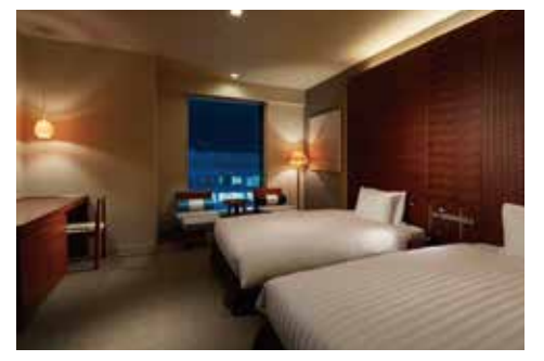
Executive Twin [35.0m<sup>2</sup>]

3 people available (Reservation required)