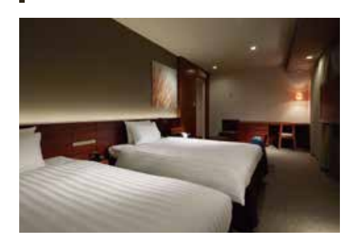
Deluxe Twin [35.9m<sup>2</sup>]

Relax in the comfortable space for two persons. (No writing desk)